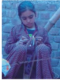
8 years old child

At a house we visited in Gujranwala, three children worked together, while their mother minded the store downstairs. One child (8 years old) was stitching an ACME World Cup 2002 promotional ball. The two younger sisters were on the roof, punching holes into the ball pieces to be stitched by their sister.