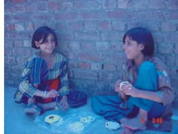
Two sisters making needle holes on panels

Two other girls were stitching ACME promotional balls. They were stitching in a room no bigger than a closet, in almost complete darkness. As if the labour conditions were not bad enough, the girls were only 11 and 13 years old.