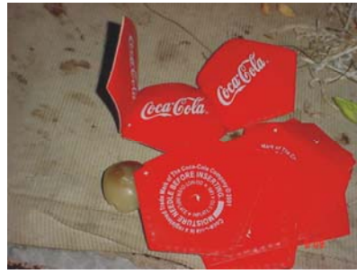
The Coca Cola promotional ball