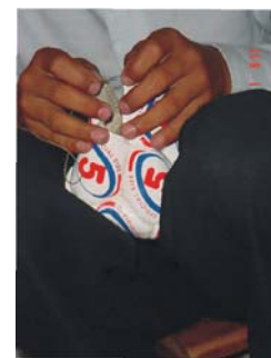
Small hands holding needles